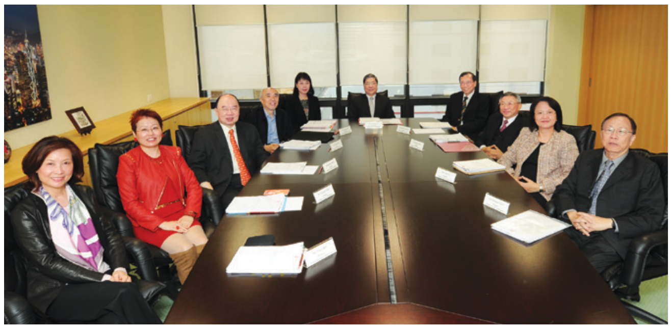
The Public Service Commission at a meeting

Curricula vitae of the Chairman and Members are at Appendix I.